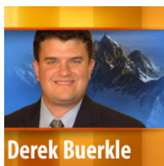
Reporting from KPAX in Missoula