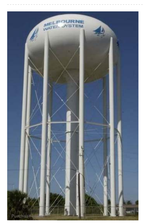
Melbourne is considering hiking its water rates beginning October 2013.

6:28 AM, May. 22, 2012 1 Comments Uhfrp p hgg Uhfrp p hgg Tweet 0 A A