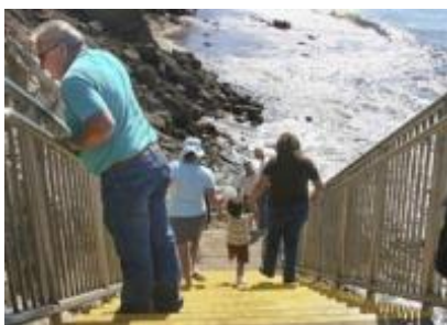
Visitors try out new stairs to the beach at the end of Beachcomber Drive in Pismo Beach following a ribbon-cutting ceremony. The stairs were among projects funded, at least in part, by development impact fees.

The slowdown in construction on the Central Coast also is restricting the flow of developer impact fees into county, city and school and special district coffers.