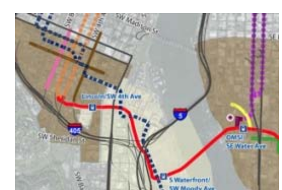
Detail of map showing projects that would be funded by new tax district.

• Clinton to the River Multi-Use Path — $600,000