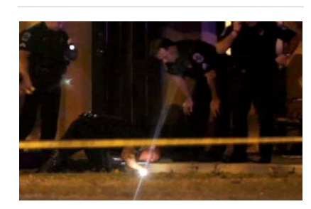
Fatal shooting in Fort Myers Feb. 01, 2012